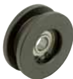
GRL-SH-H (Hardened Steel)