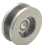
GRL-H-SUS (Stainless Steel)